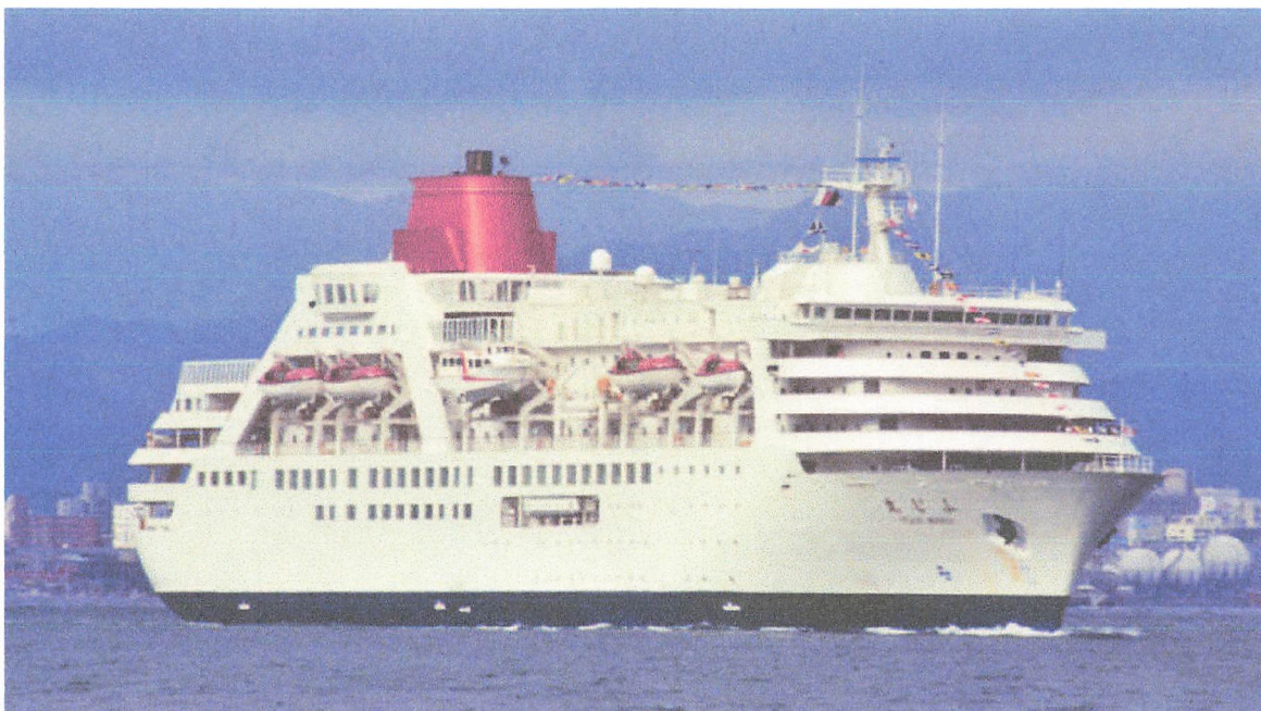
JIN as FUJI MARU off Japan 17.8.1990.